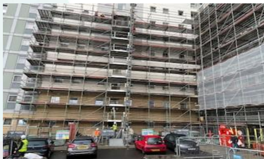
Phase 2 scaffolding ongoing

Phase 1 and 2 scaffolding is ongoing and will continue this week.