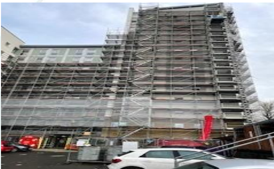
phase 1 scaffolding ongoing